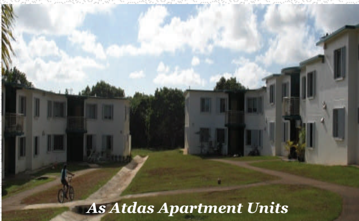
As Atdas Apartment Units

The higher Vacancy rate in FY 2010 is attributed to one of the buildings, at the At-Atdas apartments, being vacated from October 2009 to March 2010 due to renovations